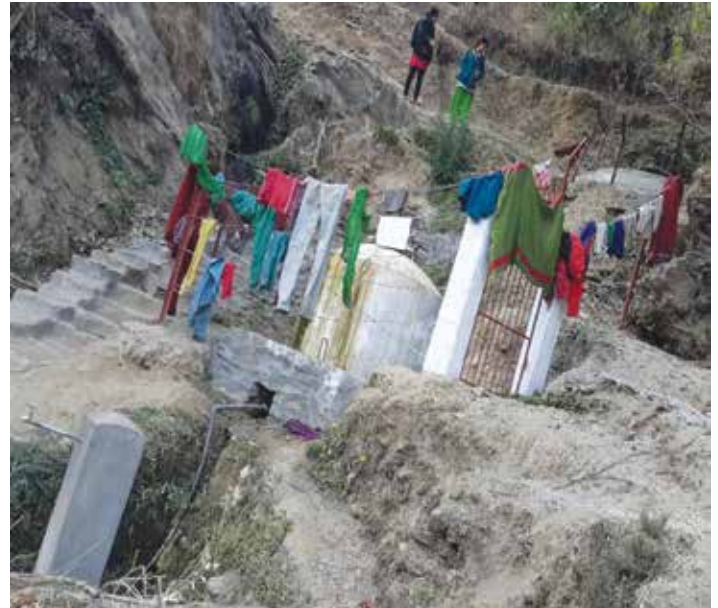
Groundwater storage is possible thanks to increased availability.