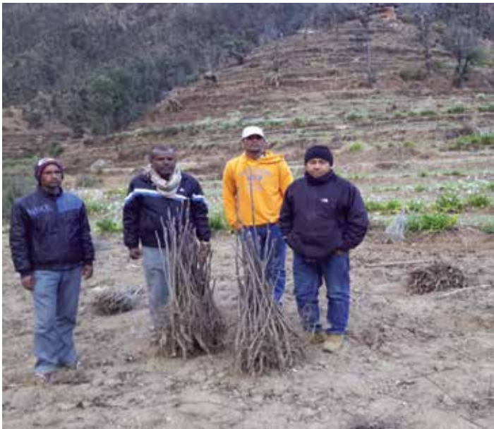
Integrated soil and water management supports diversifying agriculture enterprises benefiting communities.

We would like to thank representatives of the CIF and the PPCR Community of Practice (COP) for their support of and inputs to this document. We would particularly like to thank the participants at the Regional Learning Exchange for Latin American and Caribbean (LAC), held in Grenada in September 2017, for the discussion that contributed to the conceptualisation and content. Special thanks to PPCR COP members from Nepal for participating in discussions and interviews which formed the basis of this series of case studies; your time and expertise were invaluable.